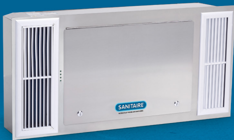
SANITAIRE ® RSCS280A

Free Standing, Wall, or Ceiling Mount for Occupied Areas