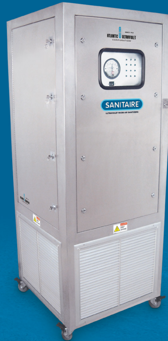
SANITAIRE ® RSM2680

Recessed Ceiling Mount for Occupied Areas