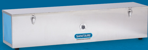
SANITAIRE ® Model RS72-RSA760

SANITAIRE ® Ultraviolet (UV-C) Room Air Sanitizers protect room occupants from infection due to flu and airborne microbes, particularly in crowded or poorly ventilated areas, and in situations where the risk of cross-infection is high. The SANITAIRE ® can effectively destroy flu and airborne microbes including bacteria, mold, and virus in enclosed occupied spaces. SANITAIRE ® Room Air Sanitizers utilize STER-L-RAY ® Germicidal Ultraviolet Lamps, which are completely enclosed within a stainless steel and reflective aluminum exposure chamber and are safe for use in rooms whether occupied or unoccupied. Shop models at BuyUltraviolet.com or click a product below.